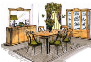
5.- dining room