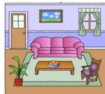
3.- living room