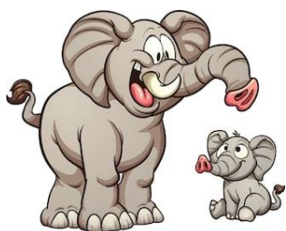
5.- big - small