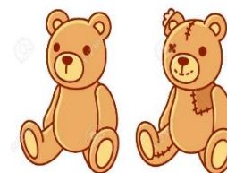
9.- new - old