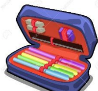
8.- pencil case