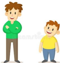
7.- tall - short