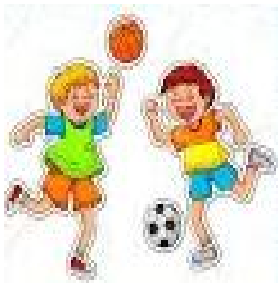
5.- P.E. (physical education)