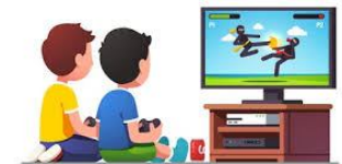
10.- play computer games