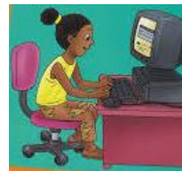
4.- computer studies