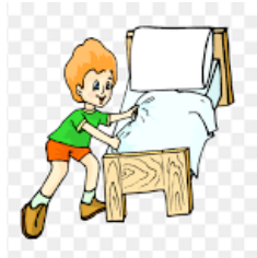
2.- make the bed