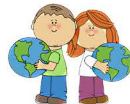
8.- social studies