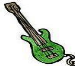
14.- electric guitar