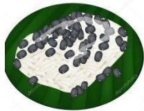
7.- rice and beans