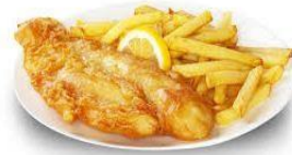
3.- fish and chips