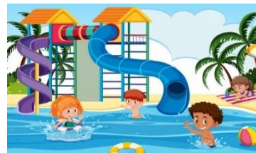
7.- water park