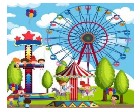
8.- theme park