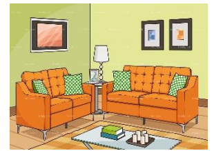
4.- living room