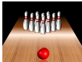
3.- bowling alley