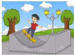
6.- skate park