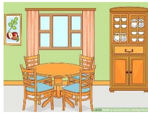
2.- dining room