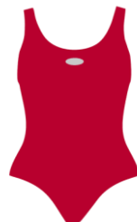
8.- swimming costume