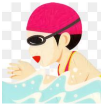
1.- swimming cap