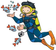
17.- scuba diving