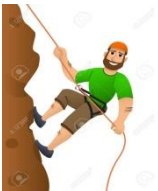
16.- rock climbing