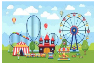
17.- amusement park