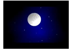
10.- the Moon