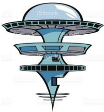
6.- space station