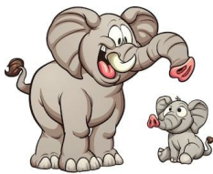
5.- big - small