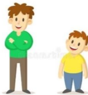
7.- tall - short