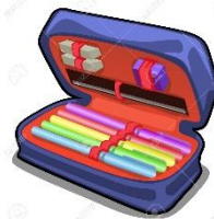
8.- pencil case