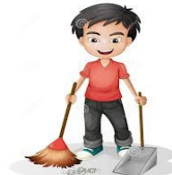
9.- sweep the floor