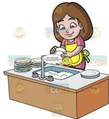
3.- wash up