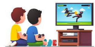
10.- play computer games