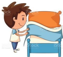
2.- make the bed