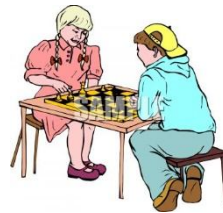
4.- play chess