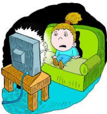
6.- watch a film