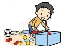
5.- tidy up