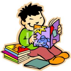
1.- read a comic