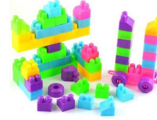
10.- building bricks