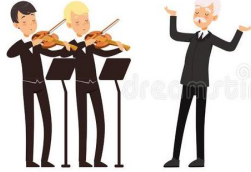
2.- classical music