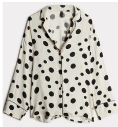
14.- polka dots