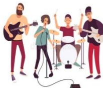
8.- pop music