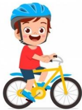
5.- ride a bike