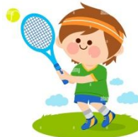
7.- play tennis