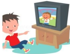
2.- watch TV