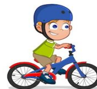
8.- ride a bike