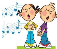
6.- sing a song