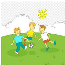
1.- play football