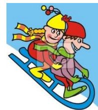
14.- go sledging