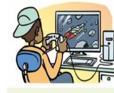
4.- play computer games