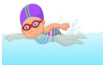
5.- go swimming