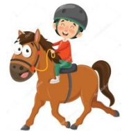
9.- ride a horse