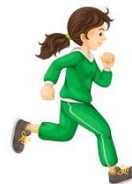
13.- go running