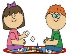
3.- play board games