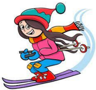
10.- go skiing