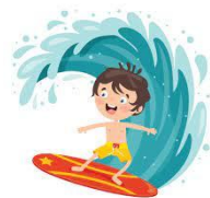
11.- go surfing