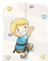
12.- go climbing