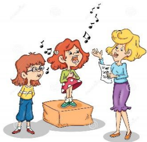
5.- have a music lesson