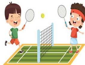
3.- play tennis