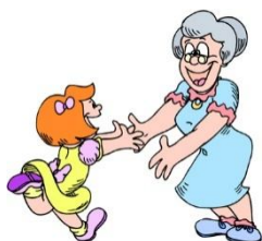
2.- visit grandma