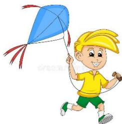
6.- fly a kite