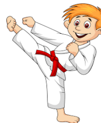
8.- do karate