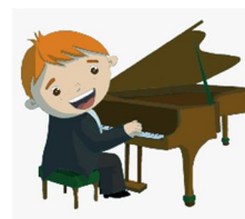
4.- play the piano