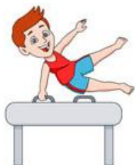
1.- do gymnastics