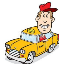
24.- taxi driver