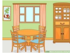
4.- dining room