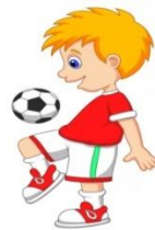
23.- soccer player