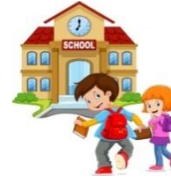
9.- get to school