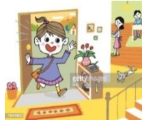
8.- come home