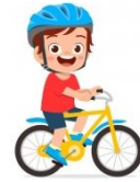
10.- ride a bike