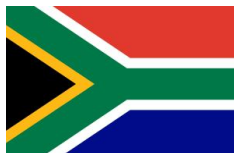
27.- South Africa