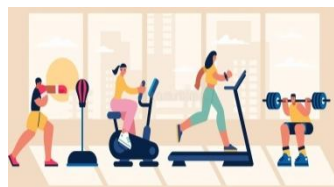
28.- sport center