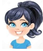
3.- dark hair