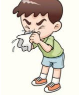
12.- a cold