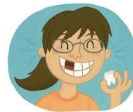
19.- tooth (2 teeth)