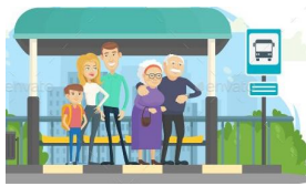
22.- bus stop