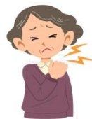
17.- a sore neck