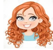
5.- curly hair