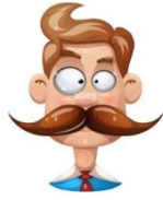
2.- a moustache