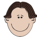
10.- round face