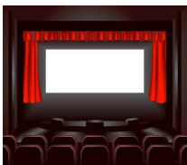
26.- movie theater