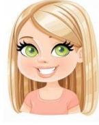
4.- light hair