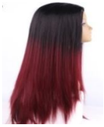
6.- straight hair